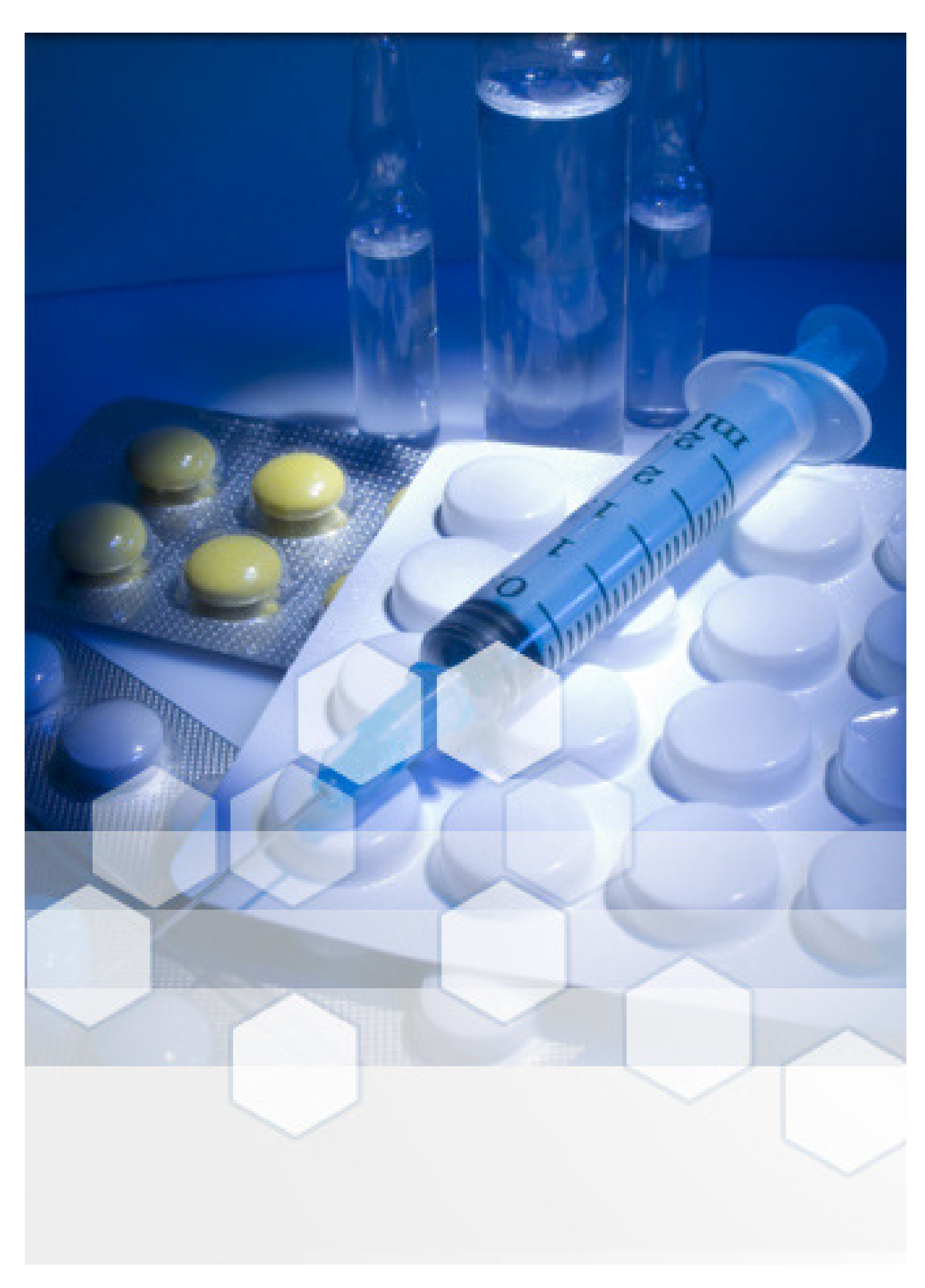
LSP Life Sciences Fund N.V.